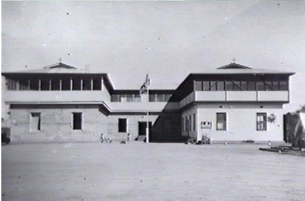
St John's Hostel in Bath Street, Alice Springs.

became a commissioner on the Australian Aboriginal Loans Commission.